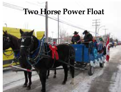
Two Horse Power Float