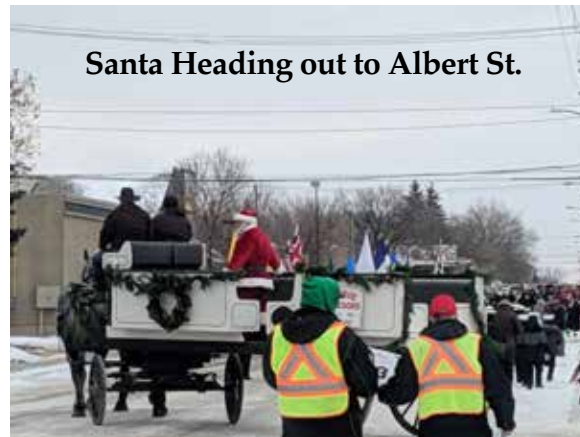
Santa Heading out to Albert St.