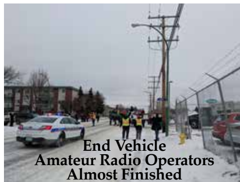
End Vehicle Amateur Radio Operators Almost Finished