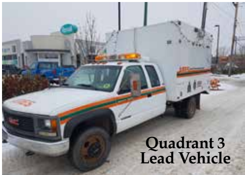
Quadrant 3 Lead Vehicle