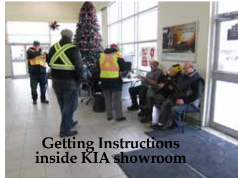
Getting Instructions inside KIA showroom