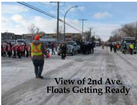
View of 2nd Ave. Floats Getting Ready