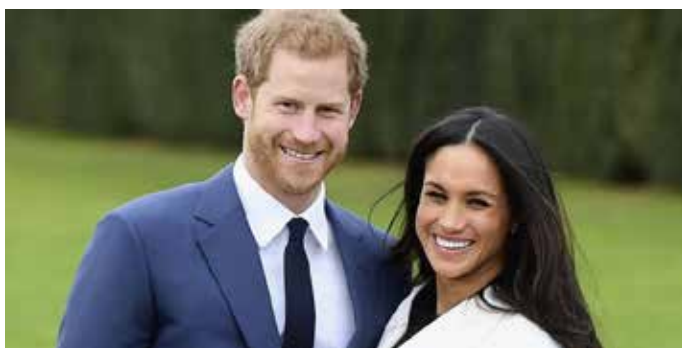
Royal Wedding between HRH Prince Harry and Ms. Megan Markle

The special call sign GR9RW will be active for five days in May to mark the occasion of the Royal Wedding between His Royal Highness Prince Harry and Ms. Megan Markle, which is due to take place on May 19, 2018 at St. George's Chapel in Windsor Castle in England.